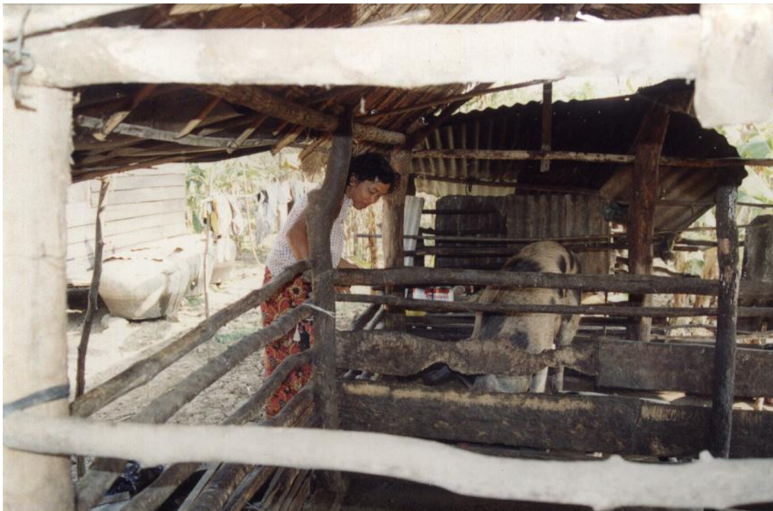
One of the mothers grows pigs just nearby her house to earn her living

Among the 20 mothers living in the village, 16 have a job and 4 do not work but are taken in charge by at least one of their children.