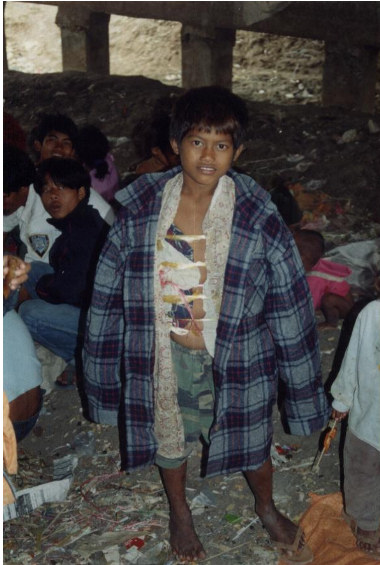
A kid getting prepared to smuggle clothes to Thailand

hanging around his body a dozen pairs of pants and recover them by wearing a large shirt. They look like young catchers, but there is a mythical control at the border and the kids can pass easily at the checkpoint. They go to sell all those clothes to the Thai market. (2)