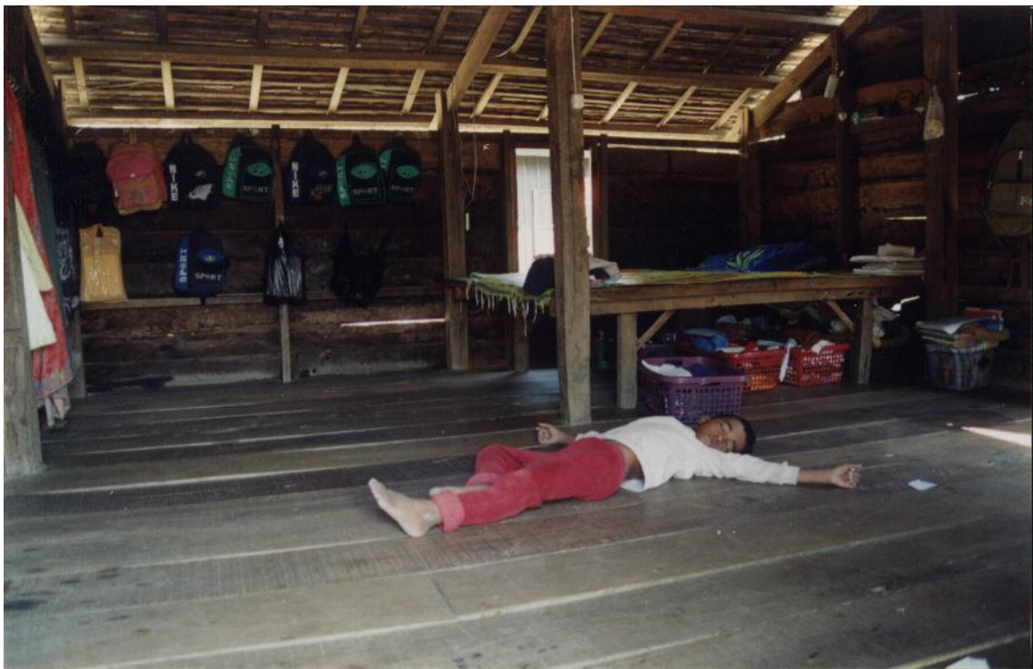
A street kid taking a nap in the centre

Every morning, some children from the street children centre go to the public school built by Krousar Thmey. As all the Cambodian pupils, they go to school only half a day. The children who stay in the centre study with the lady in charge of them. They all study again from 14h to 16h30.